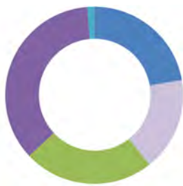
Operating Income 2018*

Our complete, audited financial statements are available by request at info@harfordlandtrust.org .