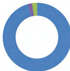
Operating Expenses 2018*