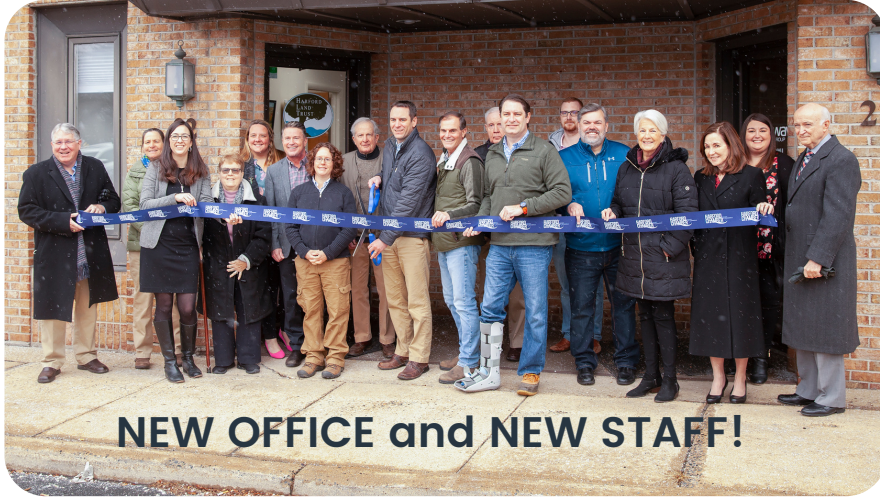
NEW OFFICE and NEW STAFF!